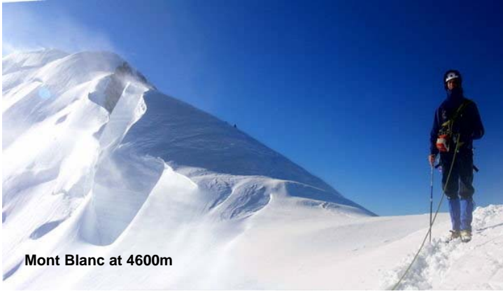
Mont Blanc at 4600m