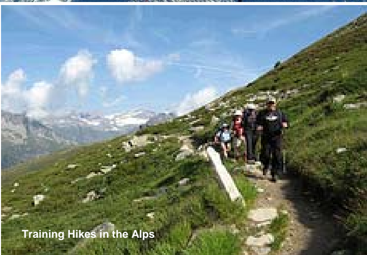
Training Hikes in the Alps

The Chamonix valley in the French Alps is dominated by the white majestic dome of Mont Blanc, the highest mountain in Western Europe at 4,807m. Every year the rounded summit of Mont Blanc becomes the ultimate objective for mountaineers the world over, all striving to stand on the summit of Western Europe and admire the beauty of the alpine scenery and major summits of the French Alps.