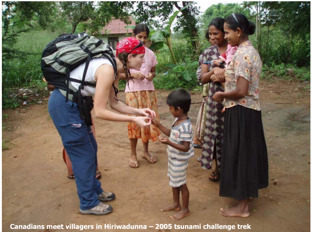
Canadians meet villagers in Hiriwadunna – 2005 tsunami challenge trek

As a small group, our itinerary has minimal impact on the environment, and our interaction with local people helps demonstrate the importance of preserving the country's cultural heritage whilst protecting the sites of historical and natural importance.